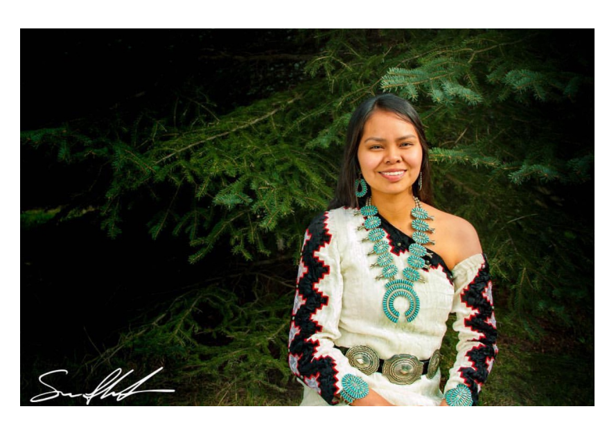
The 75 scholarship winners will be announced in April.