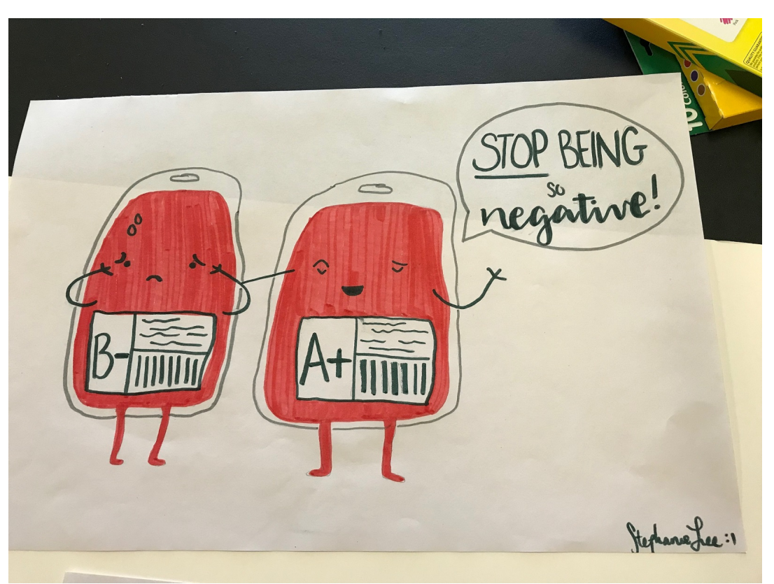
Community "challenged" to deliver 65 pints of blood; bikers and fire department pitch in

Rehoboth McKinley Christian Health Care Services will be holding its Auxiliary Blood Drive on Feb. 13 from 2 - 7 pm and Feb. 14 from 8